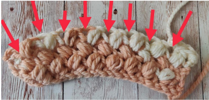
Figure Photo: Placement of bean stitch

Rows 15-18 - Rep row 2. FO and weave in ends